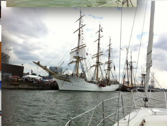
Cleveland Tall Ships/EYC Cruise July Fourth Week