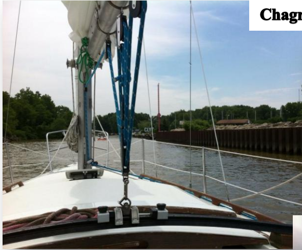
Chagrin Lagoons June 15-16