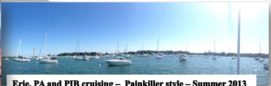
Erie, PA and PIB cruising – Painkiller style – Summer 2013